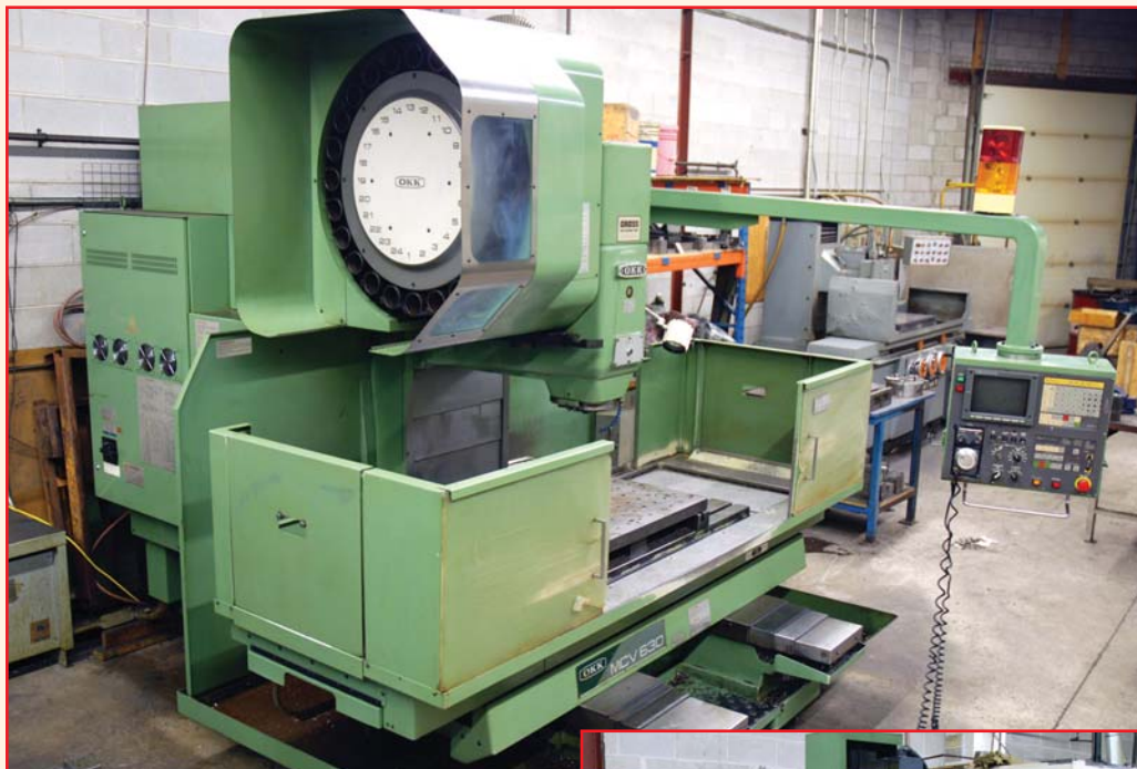
OKK CNC VMC MODEL MCV 630