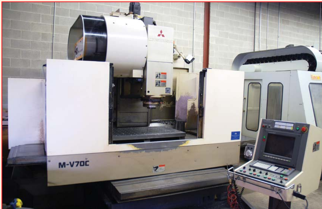
MITSUBISHI CNC VMC MODEL M-V70C