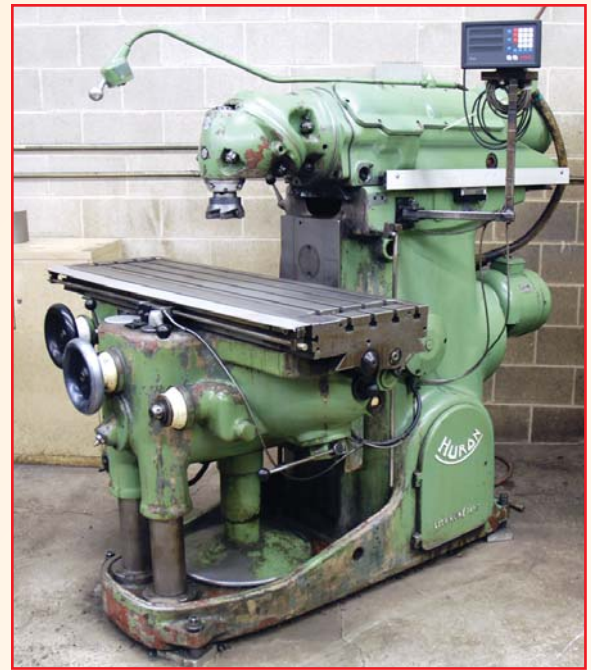
HURON RAM TYPE UNIVERSAL MILL, TYPE KU4