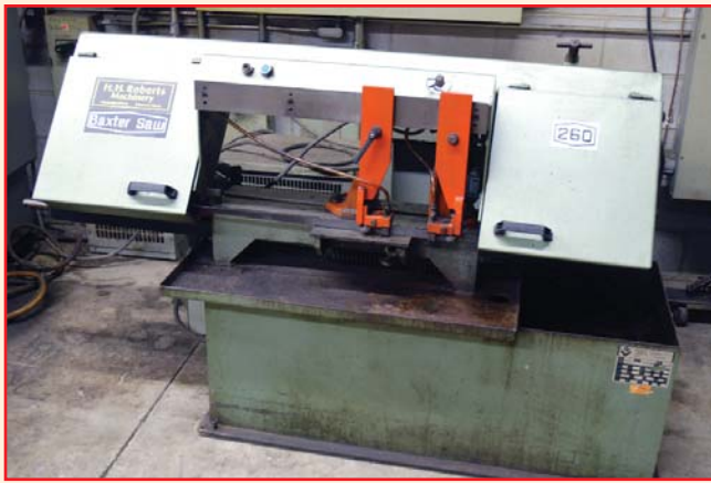
BAXTER HORIZONTAL BANDSAW, MODEL 260