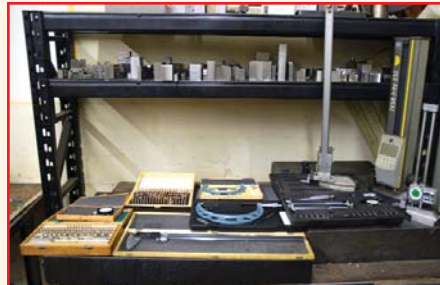
PARTIAL VIEW OF ASSORTED PRECISION MEASURING EQUIPMENT