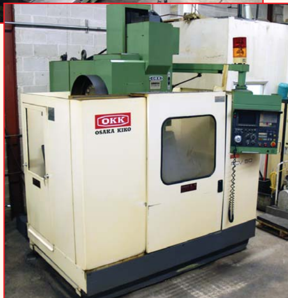
OKK CNC VMC MODEL PCV 50