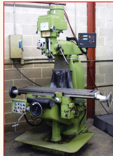
FIRST MILL, MODEL LC-18VS