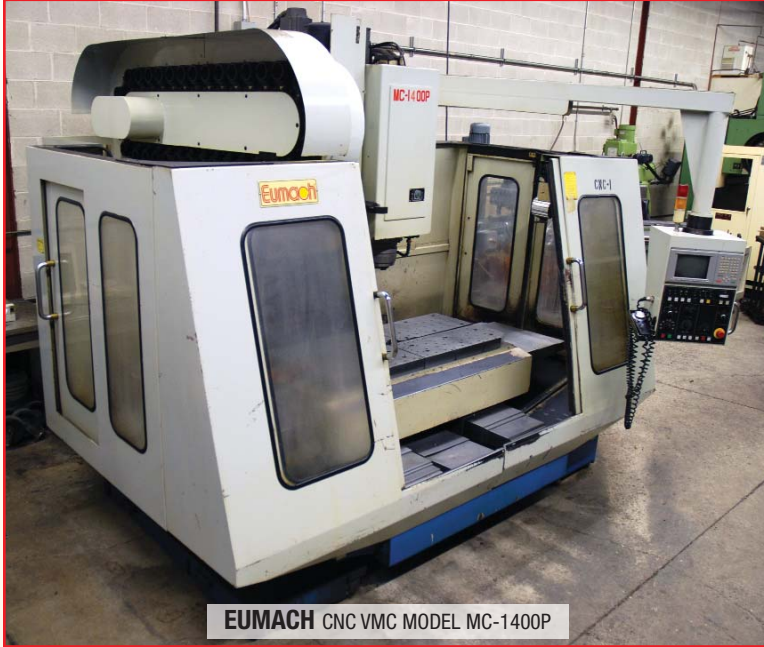
EUMACH CNC VMC MODEL MC-1400P

170 Ambassador Drive, Unit 4, Mississauga, Ontario, Canada