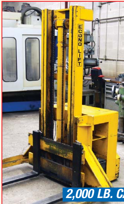
ECONO LIFT ELECTRIC PALLET LIFT