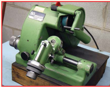
DECKEL MODEL 50 TOOL GRINDER