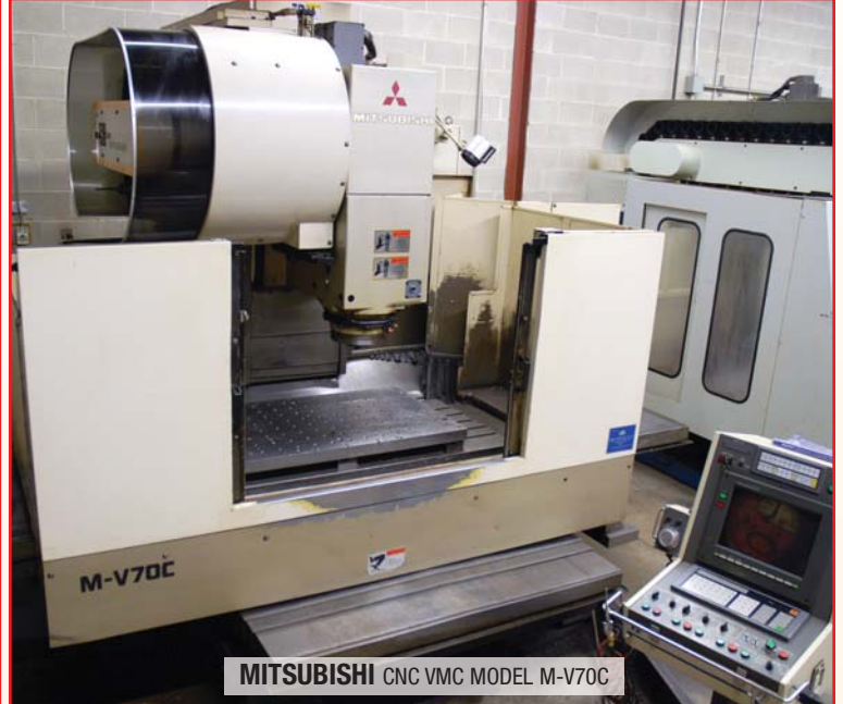
MITSUBISHI CNC VMC MODEL M-V70C