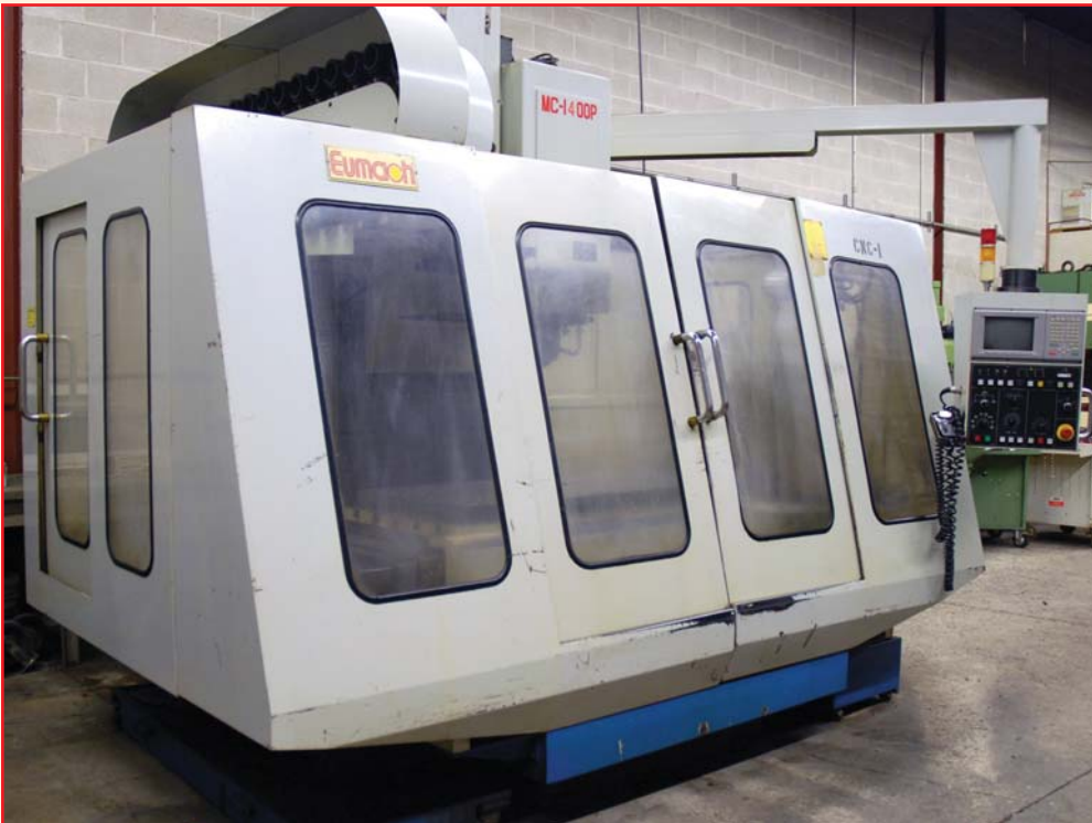
EUMACH CNC VMC MODEL MC-1400P