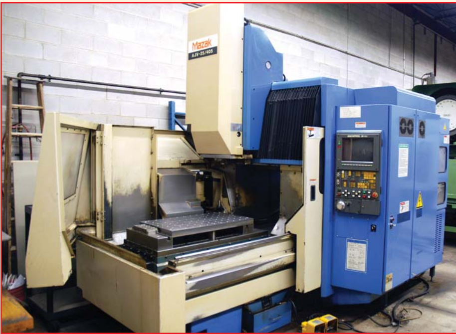
MAZAK CNC VMC MODEL AJV-25/405