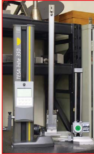
TESA-HITE 350 DIGITAL HEIGHT GAUGE

CAN'T ATTEND AUCTION? ALSO BID ONLINE VIA BidSpotter.com