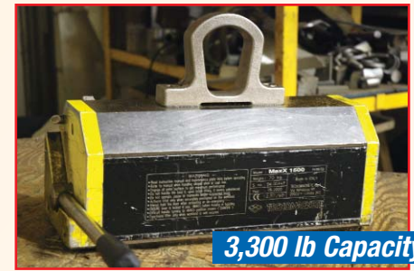
TECNOMAGNETE MODEL MAXX1500 LIFTING MAGNET